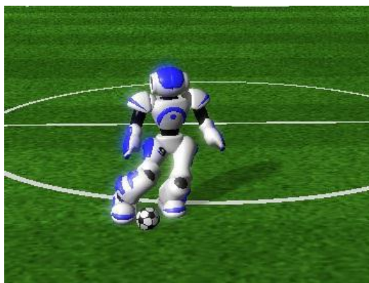
Fig. 2. Kicking to a position