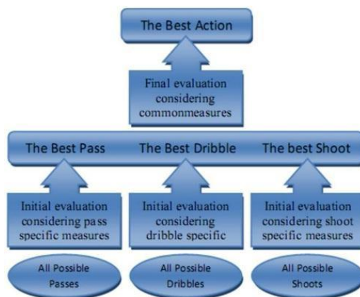
Fig. 3. Two phase decision making mechanism

To determine the best action amongst all possible ones for a given situation, we use two phase decision making method. In this method first we search for best actions in different categories, and after finding them, another search is done to find the best action between them. Comparing different types of actions seem to be difficult, but this is done using common parameters in them. Fig.3 shows the overall work diagram.