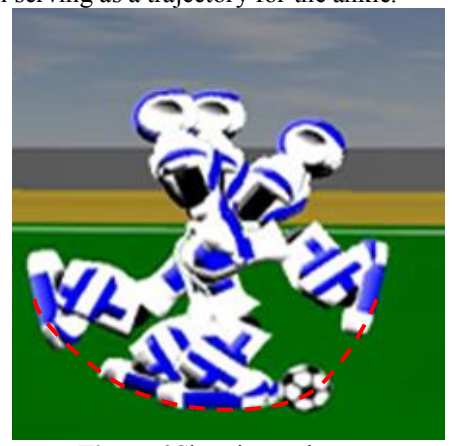
Figure 2Shooting trajectory

Shooting the ball is one of the most important skills of a soccer player. Inverse kinematic method when properly utilized, can lead to effective shoots in addition to fast reaction. A curve is obtained which begins from the current ankle position and ends in the ball position serving as a trajectory for the ankle.