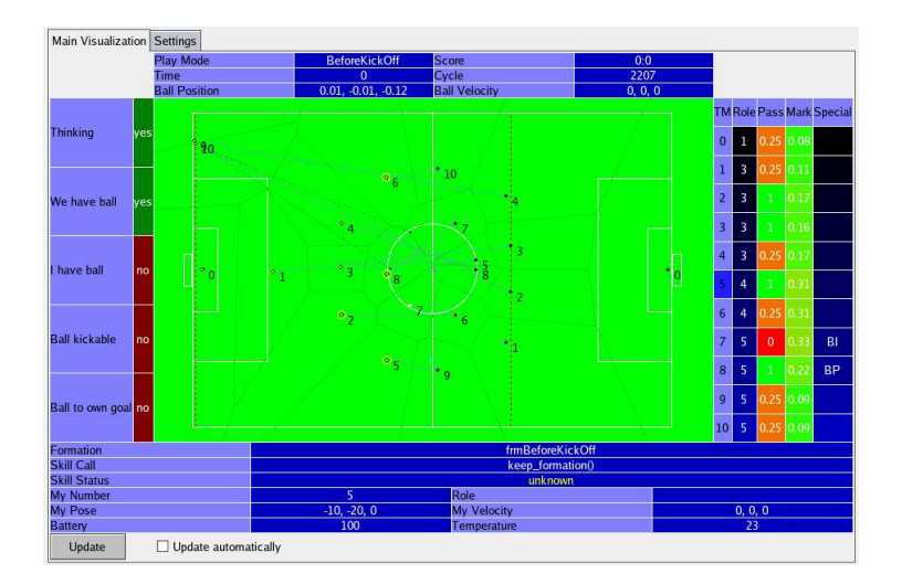
Fig. 2: World model visualization

The task of Situation Classification is to assess the current world state and to derive information on a higher level of abstraction. Here, for instance, the player who can intercept fastest and good pass partners are determined. With respect to tactical assessments, for instance, Situation Classification furthermore determines whether the current setting is offensive or defensive. Such an attribute is not only required for action selection, but also for the next higher level of the world model.